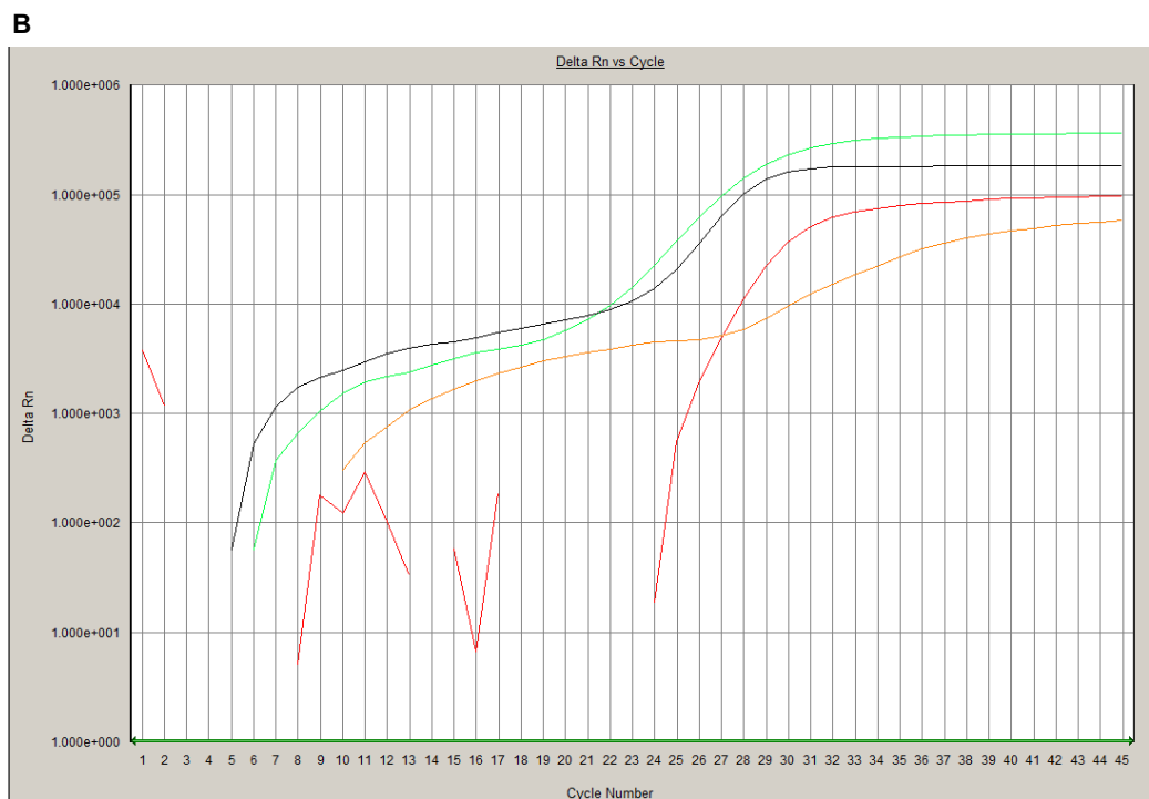
Figure 1. Examples for a positive and negative rRT-PCR result. A SARS-CoV-2 negative sample (( A ); ID 17) show a signal in the control RNA specific HEX channel (orange line) and process control channel ROX channel (green line). A SARS-CoV-2 positive sample (( B ); ID 5) shows additionally a SARS-CoV-2 specific amplification in the FAM channel (red line) and beta-Coronavirus detection (E gene) in the Cy5 channel (black line).